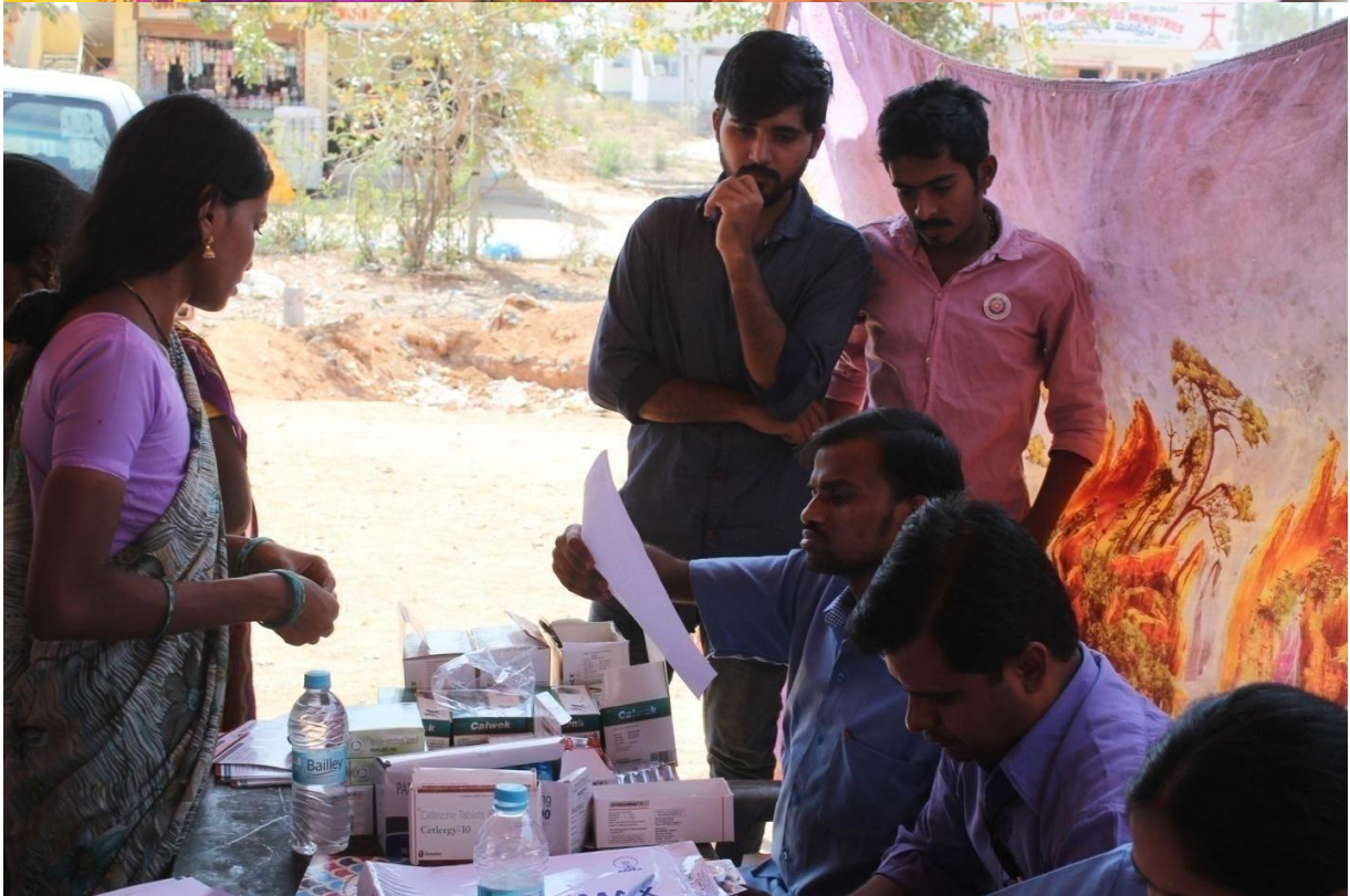
NEW VOTER ENROLLMENT CAMPAIGN