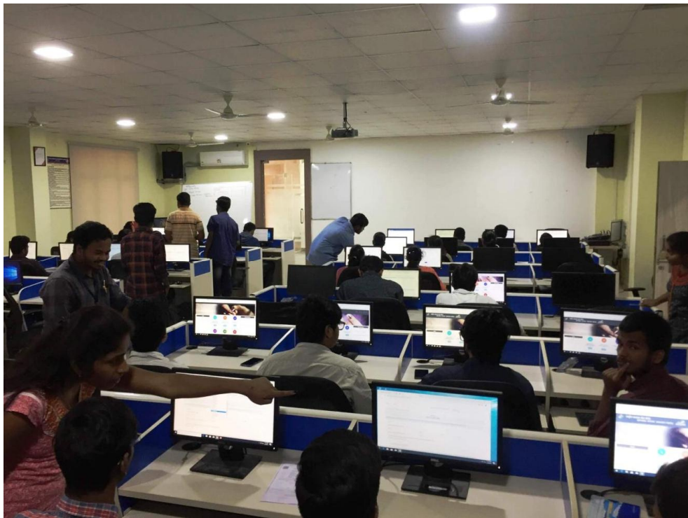
Blood donation drives contribution with Guinness world record achievements