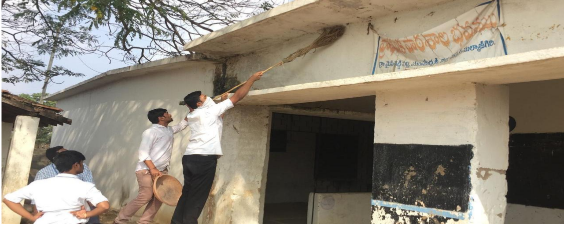
SWACH BHARATH at Govt. Primary School, Mysireddypalli village