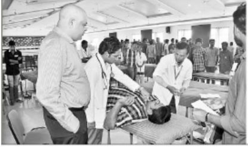
కళాశాలలో నిర్వహించిన రక్తదాన శిబిరం